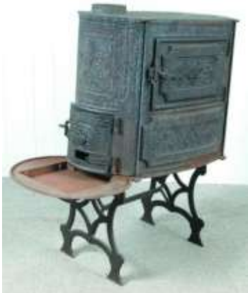
Fig. 3. A cast iron ten-plate stove. The top surface got hot enough to boil water and could be used for cooking.

The second clue to the floor plan lies in the heating method. Simon's inventory mentions two, iron, ten-plate stoves. These are much like today's wood stoves in that they sit away from the wall, give off a great deal of heat, and are connected by a pipe to a chimney. Where were these stoves located? One was certainly in the parlor. The other probably was in the kitchen and may sometimes have been used for cooking even though cooking was certainly done in the fireplace as well.