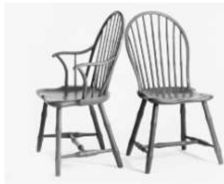
Fig. 4. Simon's Windsor chairs may have looked like these made by Joseph Henzey of Philadelphia, between 1785 and 1790.

The inventory indicates there were 3 tables and 14 chairs, 7 of which were Windsor chairs. This many were needed because of the number of people sitting down for meals. There would have been 9 or more at the table, not counting guests.