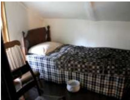
Fig. 6. Typical bed and bedroom of 1800.