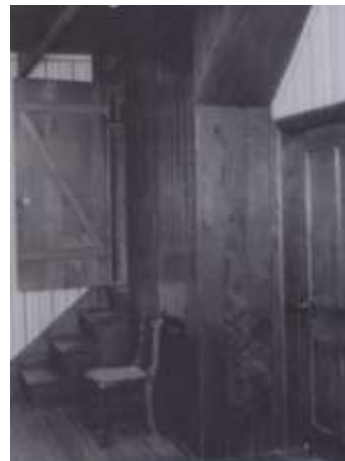
Fig. 5. Typical enclosed staircase of a Penna. German farmhouse in the 1700's and early 1800's. 8

Upstairs in the house: Most Pennsylvania German houses did not have open staircases. The stairs were fitted into a kind of closet, usually at the far end of the kitchen. 7 They may have originated in an effort to keep the heat in the living area rather than allowing it to rise up the stairs into the second floor. It is quite likely that Simon's house had a staircase like this.