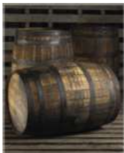
Fig. 15. Barrels were used to store everything from whiskey and cider to apples and salted ham. http://www.barrelsunlimited.com

What happened then? After the sale of the house and its contents, the estate was distributed according to Simon Jr's will. Those listed in red were still alive and entitled to their portion of the estate. It's unclear if the remainder of the estate was distributed just to the survivors, or if the estates of the dead children received their portion of Simon's money. In any case, at the time of the final distribution of the money from the estate in 1837: