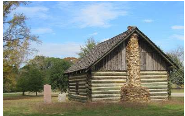
Fig. 9. A typical settlers log church in Elkhart, Texas. No doubt Jost's Church and the others in Northampton County in the mid-1700's looked much like this.

There were other small congregations in the area as well. St Paul's Indianland Church located to the north near Lehigh gap 13 , was essentially a Lutheran Church, while to the east, there was the Reformed congregation of Little Moore Church. All these churches were abandoned in 1755-56 when the Indian attacks began and people fled south, to safety. Settlers began returning about 1760 and the congregations were revived, but not always in the same place. St. Paul's Indianland Church, for example, moved to the border of the Indian Land Manor. 14 Perhaps there was thought, already then, of moving "Jost's church" farther south to serve a larger community.