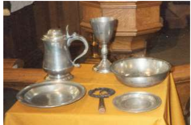
Fig.11. Display of early Zion Stone Church pewter vessels. The chalice, top middle, the bowl to the right, and the small circular object, center front, (glinge Seck) were from the oldest congregation in Lehigh Township, Jost's Church. Photo taken at Zion Stone Church during the 1995 Dreisbach Family Ass. reunion.