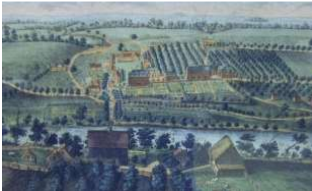
Fig. 5. The large Moravian settlement at Bethlehem ca.1763. From a painting at the Moravian Archives in Bethlehem, PA.