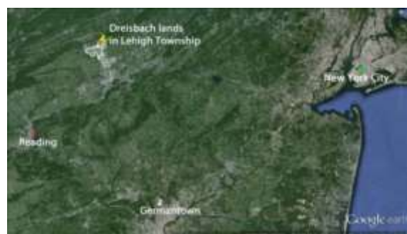
Fig. 2. Map to show how far away the Dreisbach lands located in Lehigh Twp were from the more developed areas of Reading, Germantown and New York City.