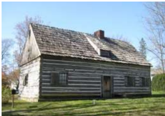
A log house, similar to but probably a bit larger than those of the Dreisbach family. This is Gray Cottage built in 1743 in Nazareth, PA.

At the DFA 2013 Reunion which will be held near Valley Forge, we will learn more about Washington and his army and what occurred during that fateful winter. The juxtaposition of these two - Valley Forge and the DFA Reunion leads us to ask: Where were the Dreisbach men during that Valley Forge winter of 1777-1778?