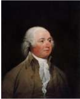
Portrait of John Adams, Second President of the United States by John Trumbull, 1792-93 http://en.wikipedia.org/wiki/John_Adams

John Adams, the second President of the United States recognized this when he said "I should say that full one-third were averse to the revolution ... the yeomanry, the soundest part of the nation, always averse to war, were rather lukewarm" on the idea of a revolution. 13