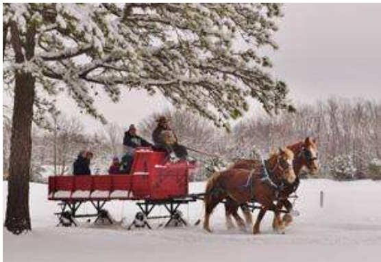
In the 1700's roads were terrible. Travel was easiest in winter, by sleigh. Most supplies delivered to Valley Forge, probably arrived by horse drawn sleigh.