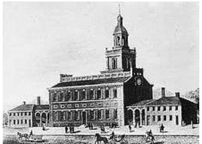
Exterior of Independence Hall in the 1700's.