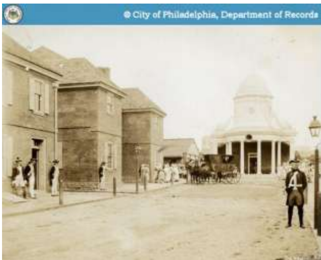
Photo of a re-enactment to show Philadelphia as it was in 1776. http://www.phillyhistory.org

Simon Jr and Independence: Gov. John Penn was removed from office in May 1776. On 4 July 1776, Independence was formally declared. After this the governing of Pennsylvania was done by the elected Assembly and by the Council of Safety, headed by Benjamin Franklin.