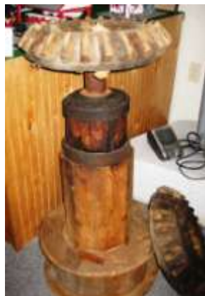
Wood bench and wooden gear, both from Cherryville mill