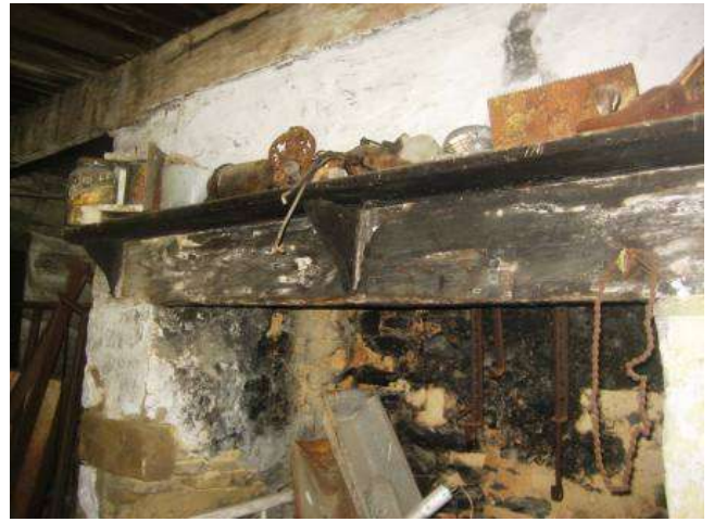
Photo of upper half of the walk-in fireplace in the log cabin.