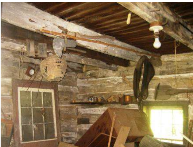
Log cabin interior with walls made of hand hewn beams.