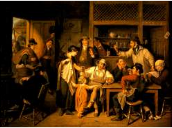
A Colonial Tavern Scene – unknown artist.

they would be tried by a Court Martial for their bad conduct.